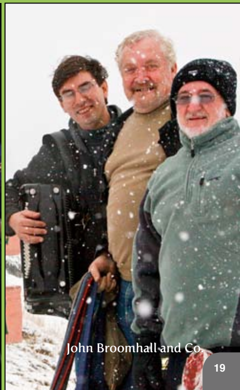
John Broomhall and Co.