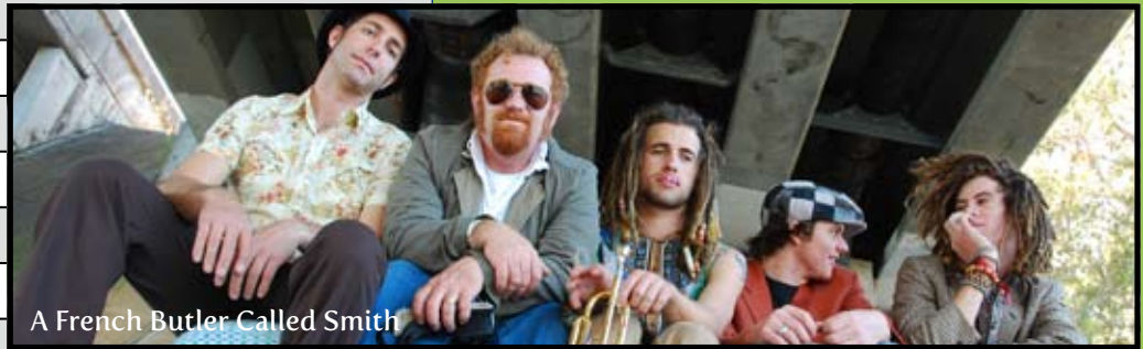
A French Butler Called Smith