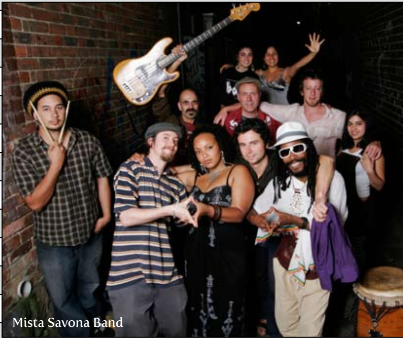
Mista Savona Band